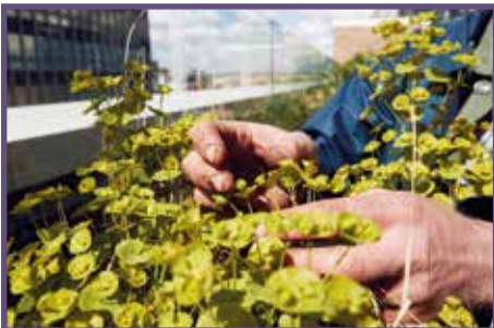
Plant city gardening.

Scan the QR Code to access the NOMA Engage website.