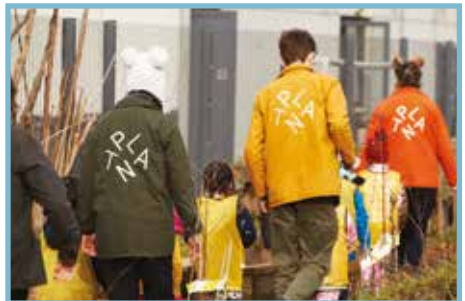
Plant city gardening team.