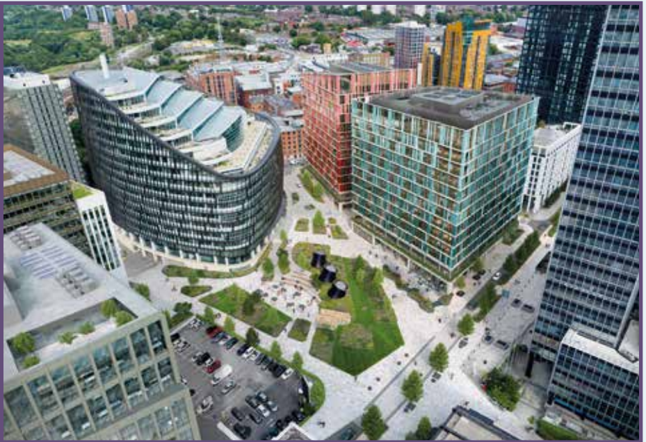
Indicative image of 2 and 3 Angel Square.

Usually no work will be carried out on Sundays or bank holidays.